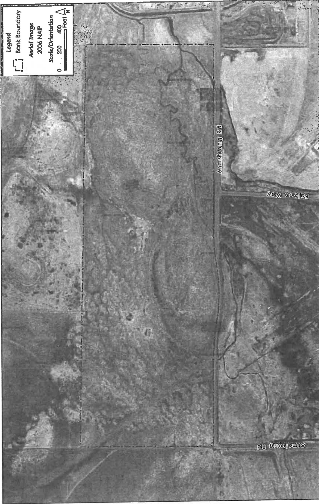
Figure 3 Aerial Photo