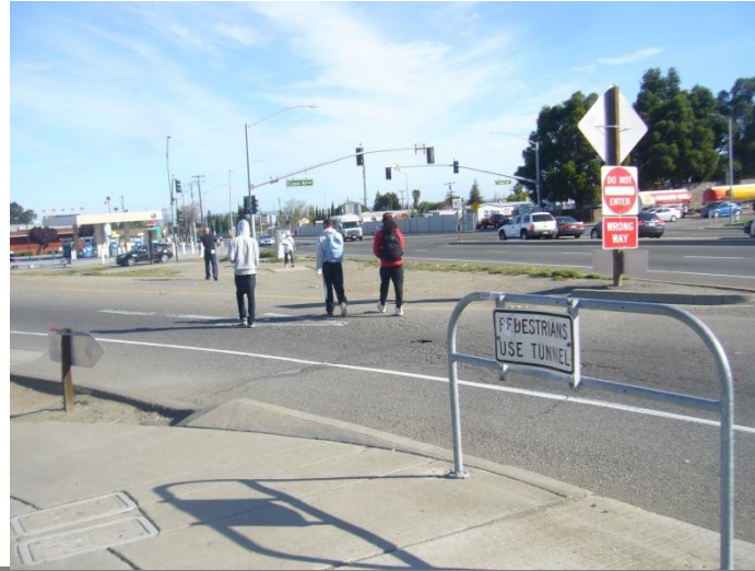
(Left) The existing pedestrian tunnel under the State Route 4 westbound loop off-ramp is underutilized. (Right) Pedestrians often cross the uncontrolled westbound loop off-ramp in lieu of using the pedestrian tunnel