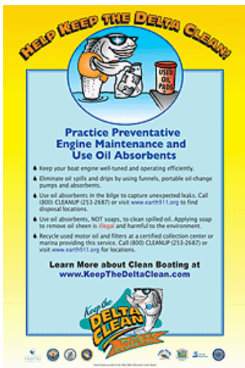
Boat Maintenance Poster Quantity: 1 or 2