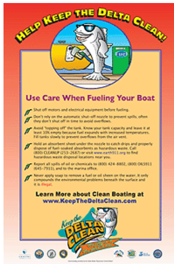
Fueling Poster Quantity: 1 or 2