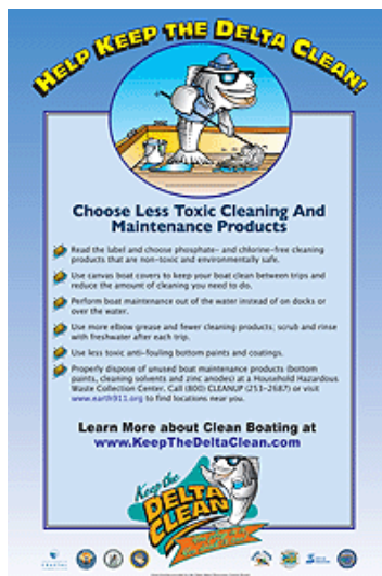
Clean Boating Poster Quantity: 1 or 2