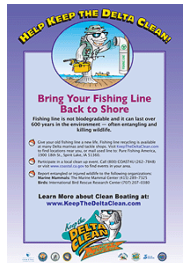
Fishing Line Poster Quantity: 1 or 2