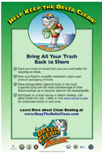
Trash Poster Quantity: 1 or 2

Do your part to promote clean boating! Post these FREE posters on bulletin boards, facility entrances, kiosks, dock entrances, boat launch ramps, fuel docks and in marina and yacht club offices.