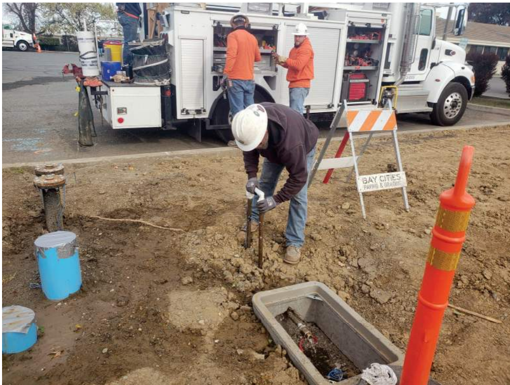
Figure 3 – Waterline Testing and Prep for Cutover