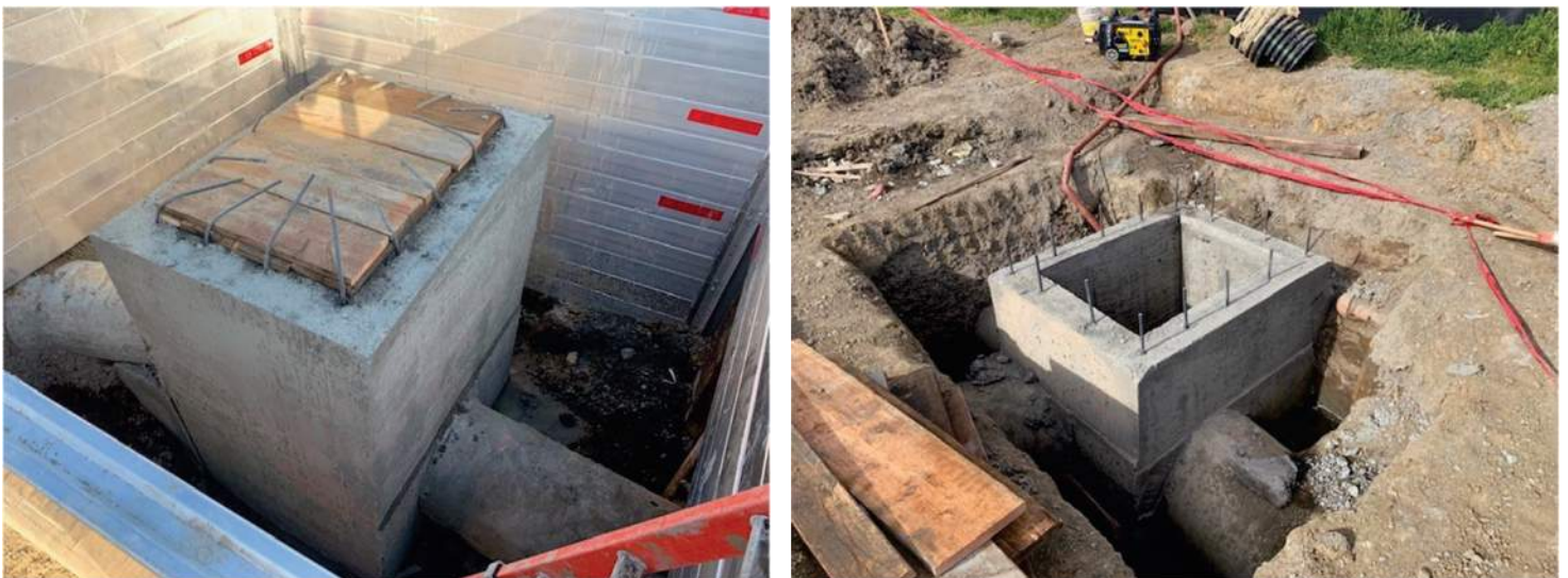
Figure 2 – Drainage System 2 – Catch Basins