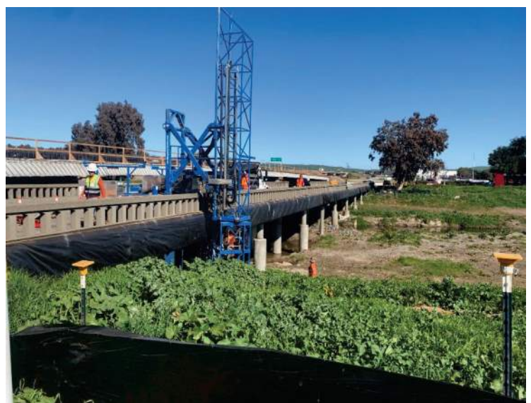
Figure 2 – Existing Bridge Bird Nesting Exclusion System