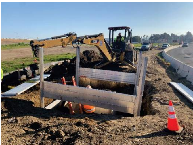
Figure 5 – Storm Drainage Improvements