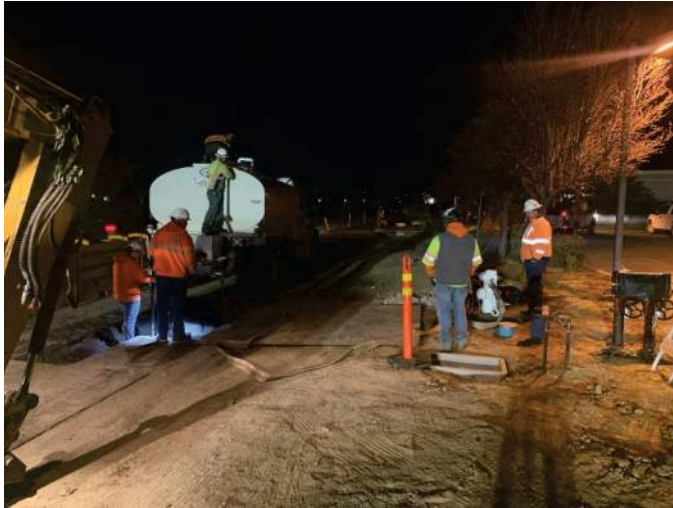
Figure 3 – Waterline Cutover