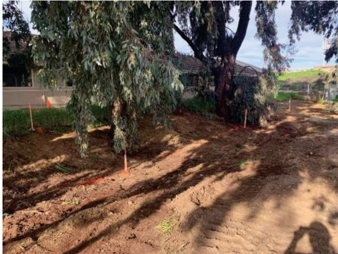
Figure 4 – 5000 Marsh Drive Drainage Improvements