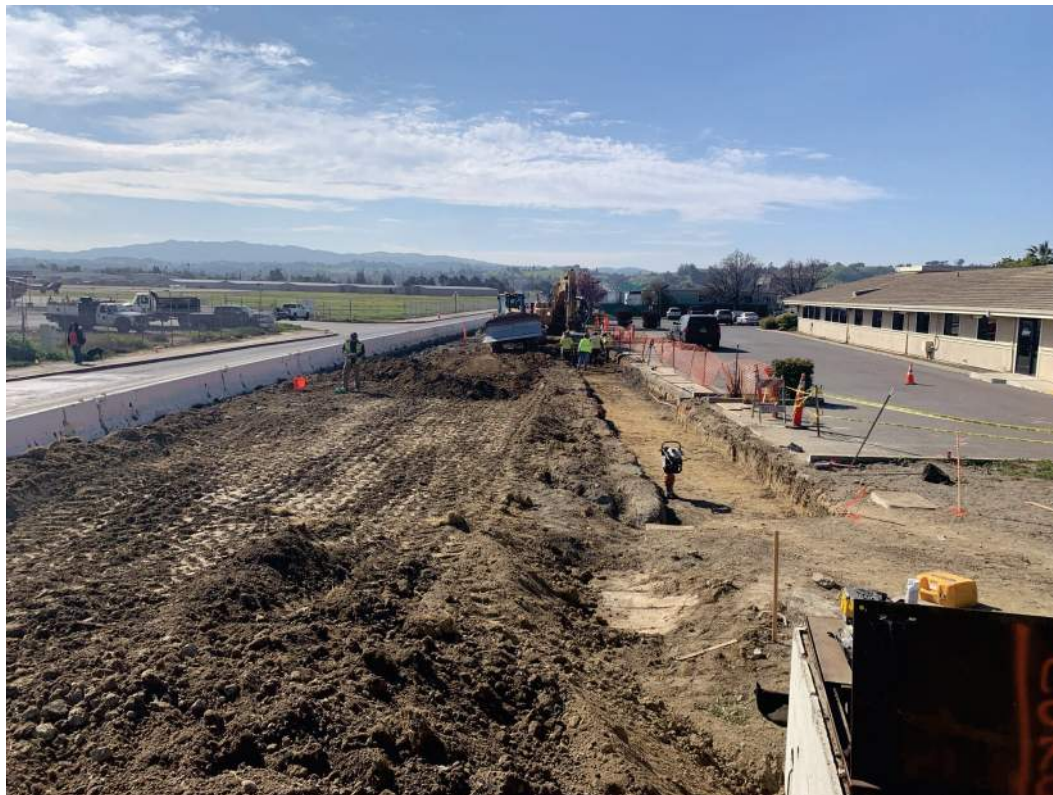
Figure 4 – Retaining Wall Excavation