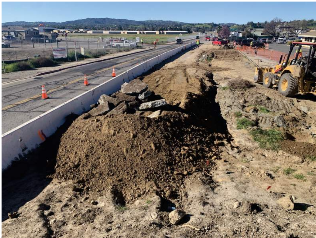
Figure 2 – Retaining Wall Excavation Prep Work