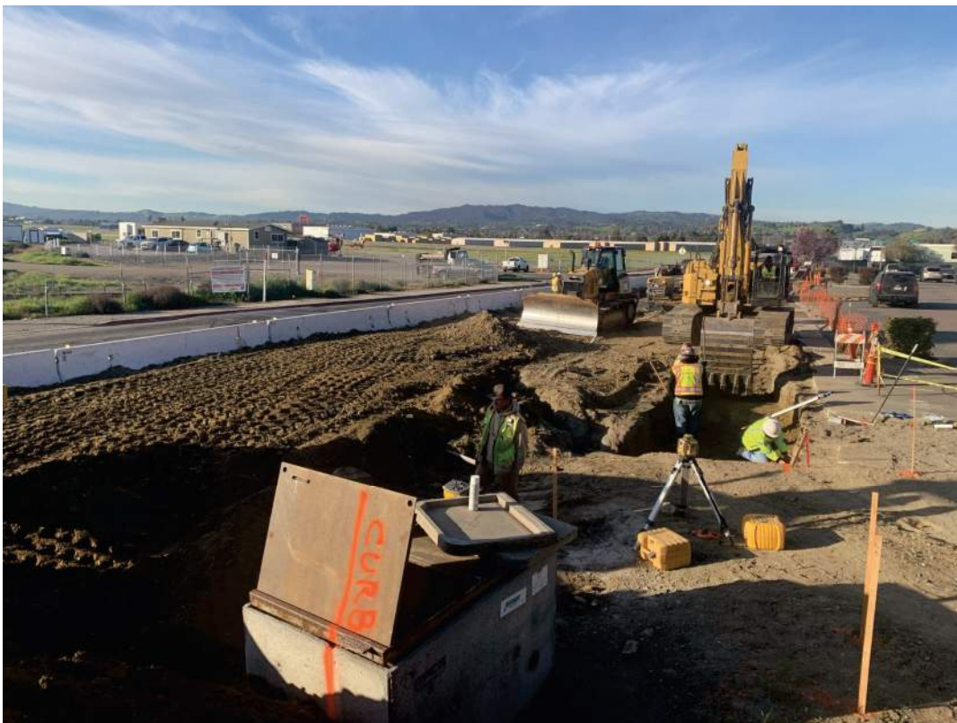
Figure 3 – Retaining Wall Excavation