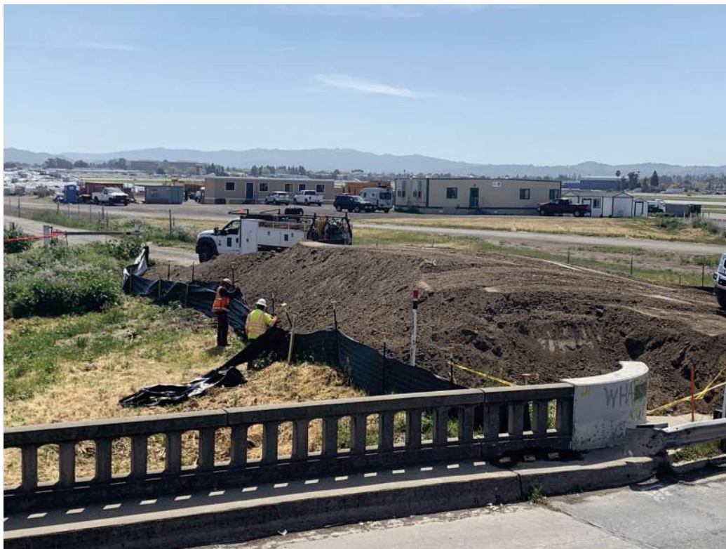
Figure 2 – Crews Install Silt Fence