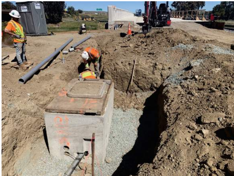
Figure 3 – AT&T Conduit (Westside)