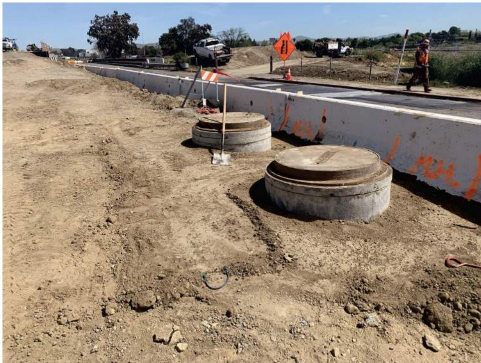
Figure 5 – CCWD Emergency Shutoff Valve Adjustment to Grade