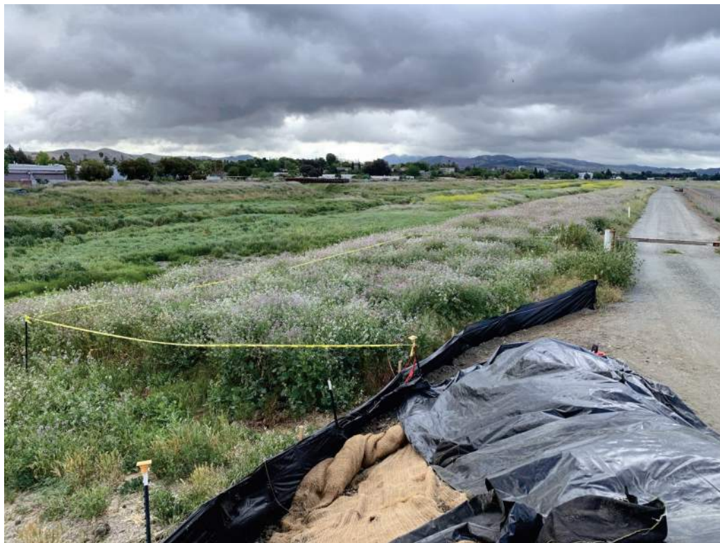
Figure 4 – Contractor's Proposed Staging Area