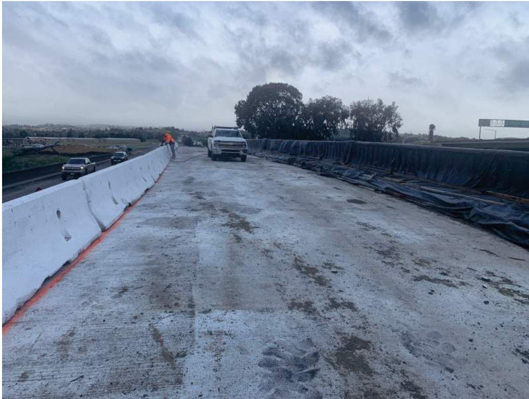
Figure 3 – Stage 2 K-rail Install