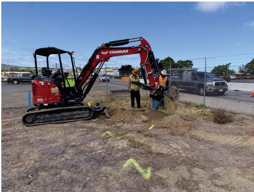
Figure 5 – AT&T 5005 Marsh Utility Relocation