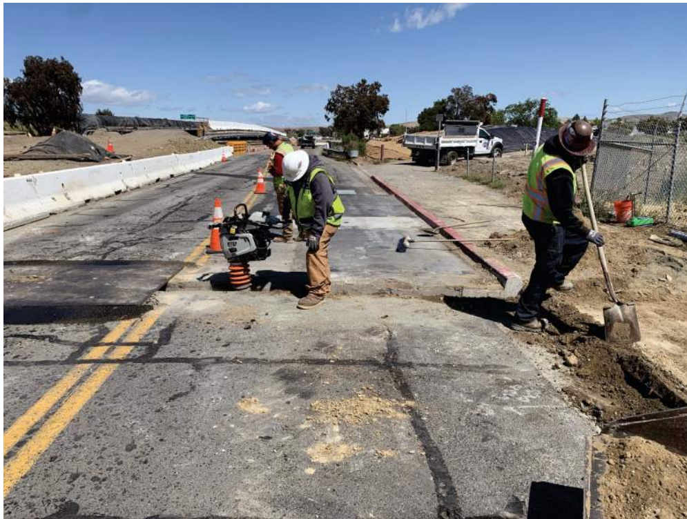
Figure 2 – AT&T Utility Service Relocation