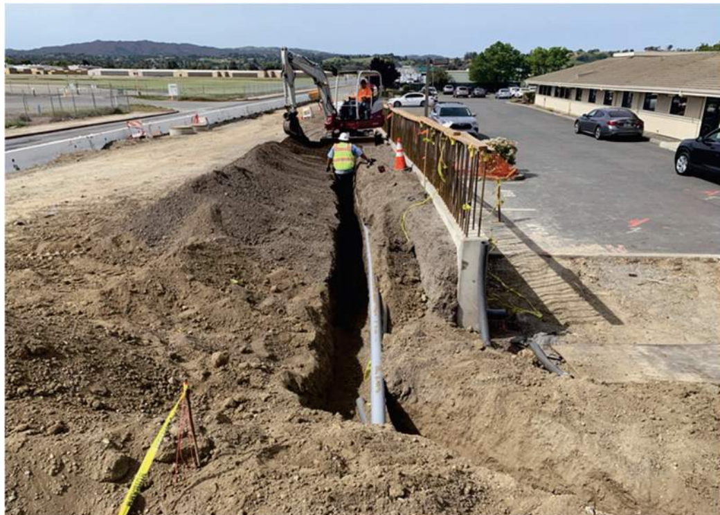
Figure 2 – 5005 Marsh PGE Service Conduit Installation