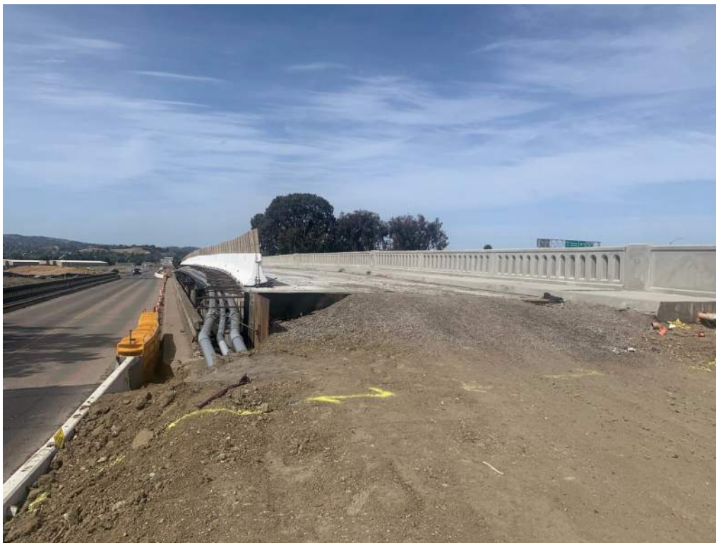
Figure 2 – PG&E Utility Service Relocation Completed