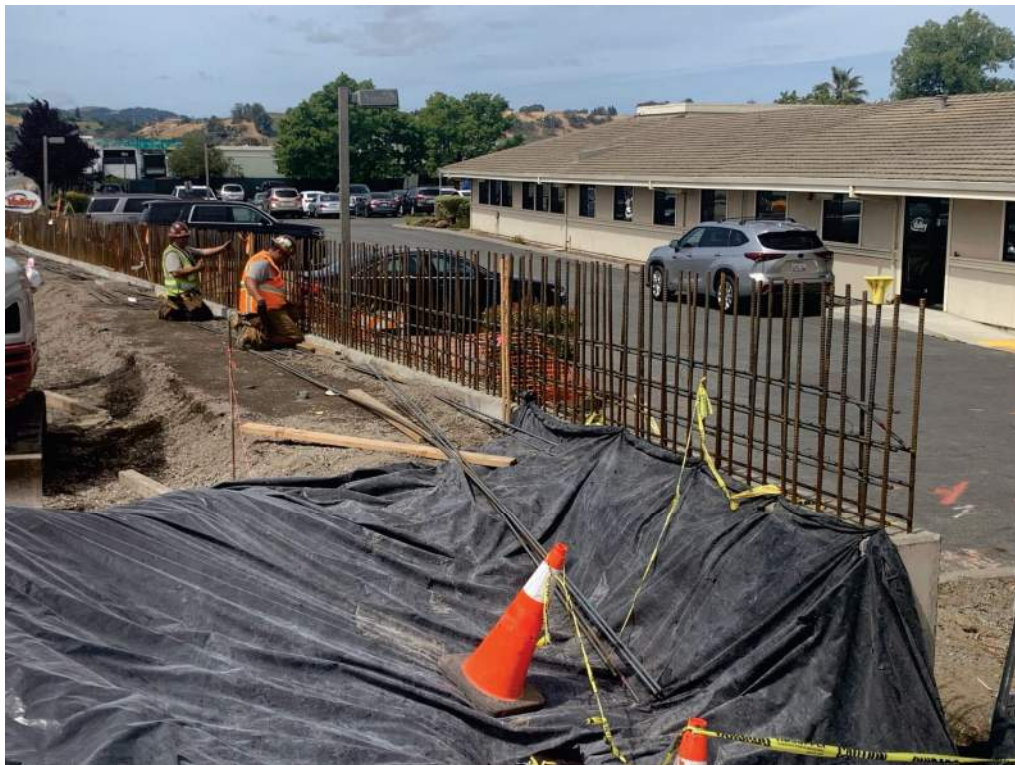
Figure 4 – Type 732SW Concrete Barrier Rail Reinforcement Install