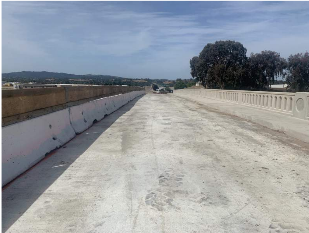
Figure 3 – Stage 2 K-rail