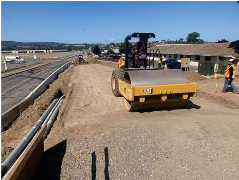
Figure 4 – Westside Subgrade Compaction