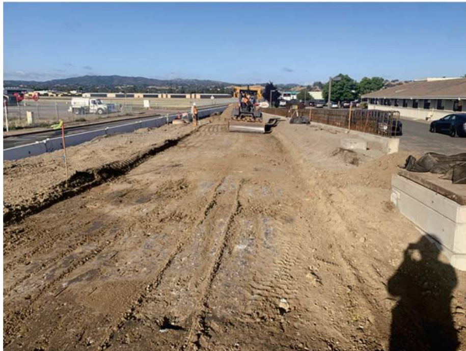
Figure 2 – Finish Grading Westside