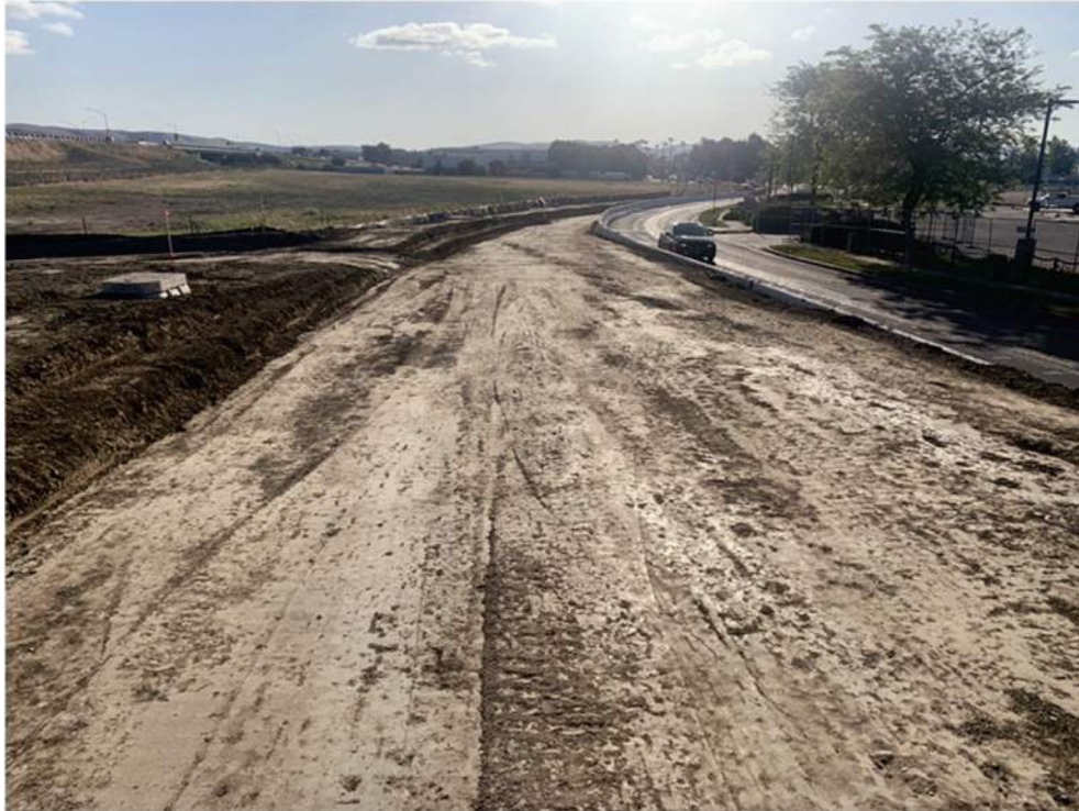
Figure 3 – Eastside Approach – Finish Grading