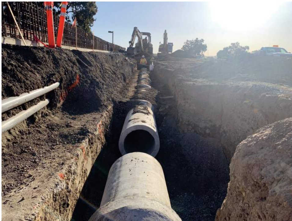
Figure 2 – Drainage System 1