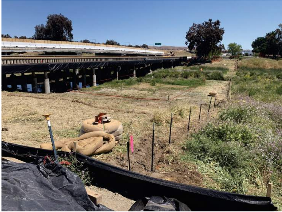
Figure 3 – Installing ESA / Silt Fencing