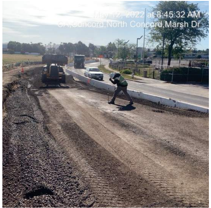
Figure 5 – Eastside Class 2 AB Compaction Testing