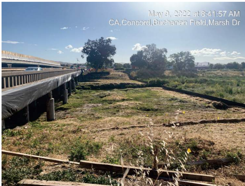
Figure 2 – Creek BMPs Installation