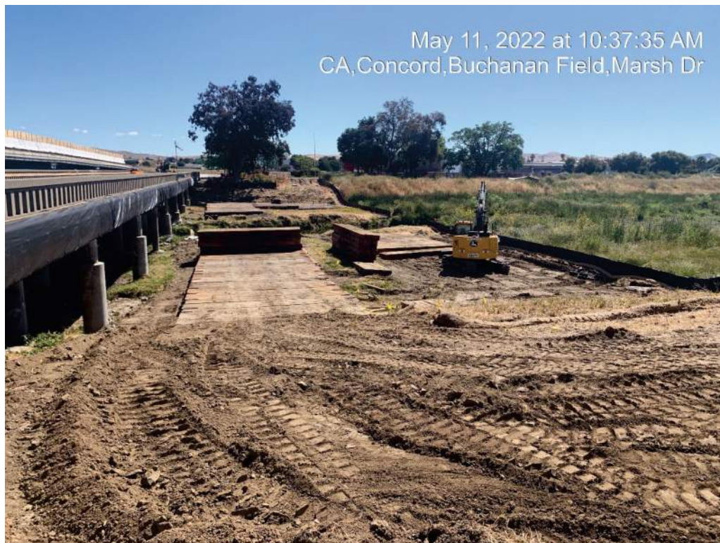
Figure 4 – Creek Protection – Cranemats Install