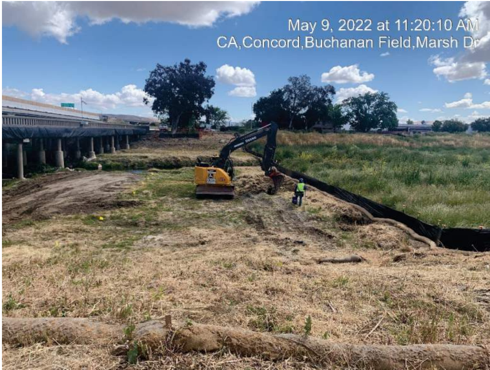
Figure 3 – Preparing Area for Cranemats