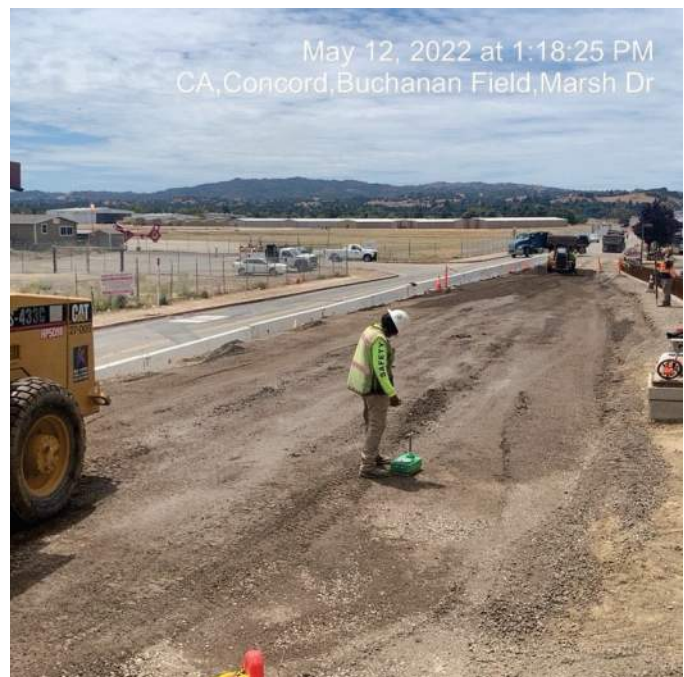
Figure 6 – Westside Class 2 AB Placement & Compaction Testing