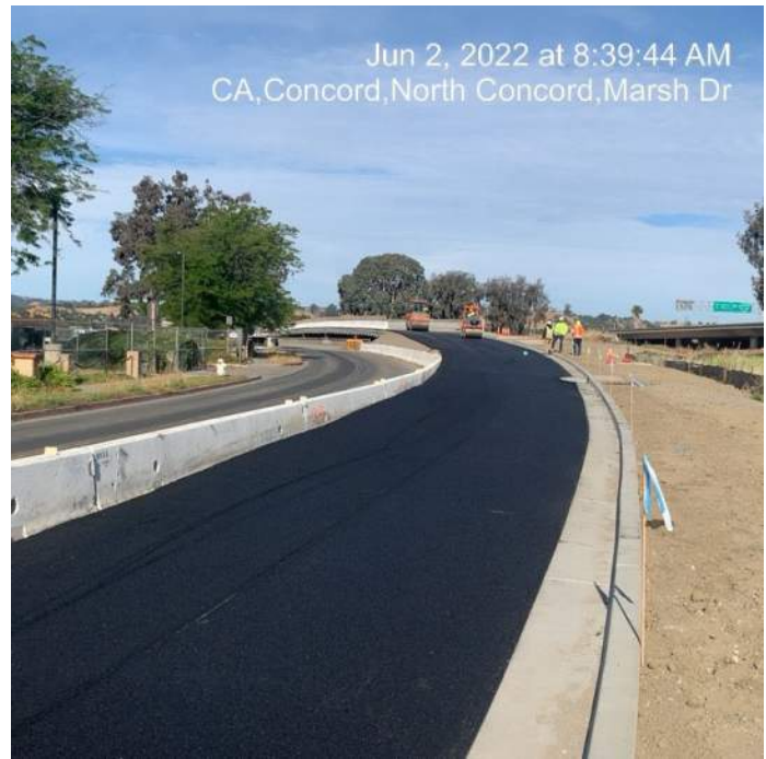
Figure 3 – Stage 1 HMA Paving (Eastside)