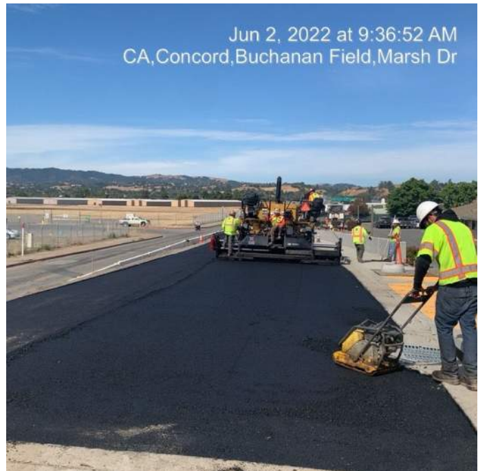
Figure 4 – Stage 1 HMA Paving (Westside)