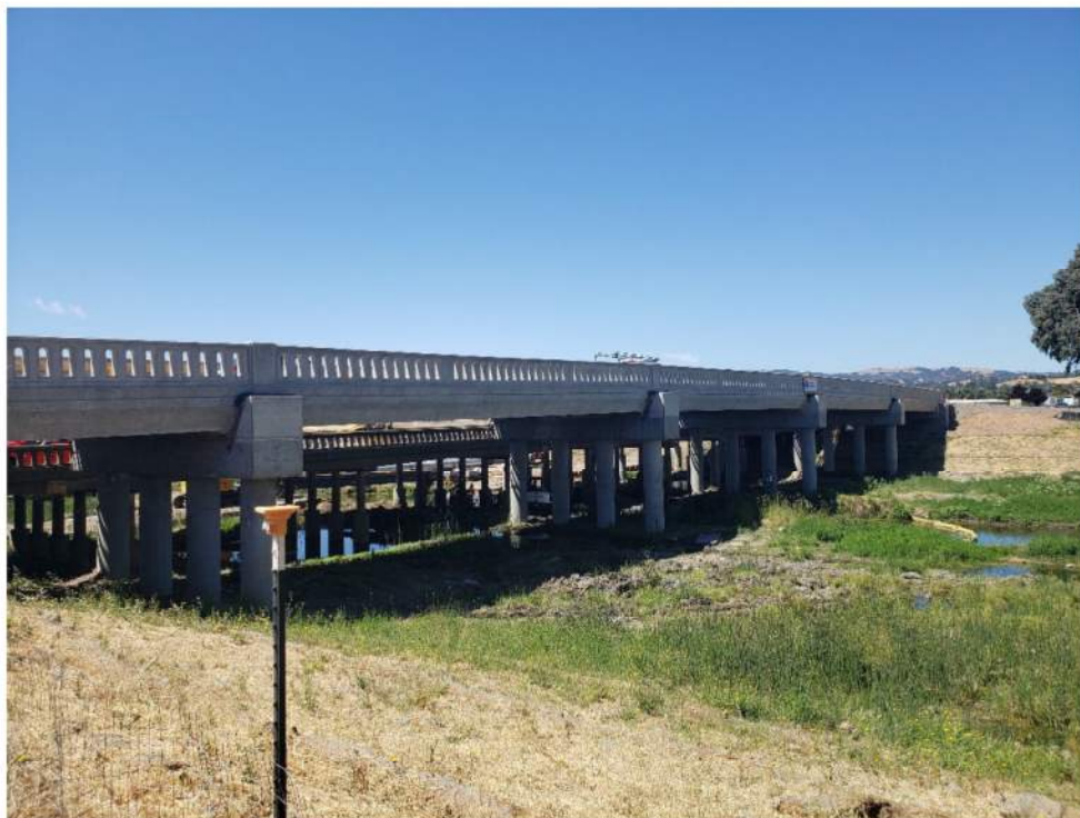
Figure 2 – Stage 1 Bridge