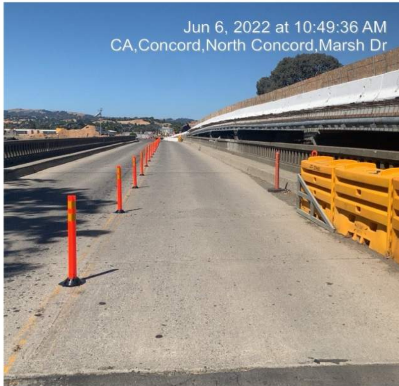
Figure 3 – Stage 1A Traffic Switch