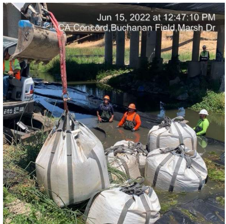
Figure 4 – Stage 2 Creek Diversion