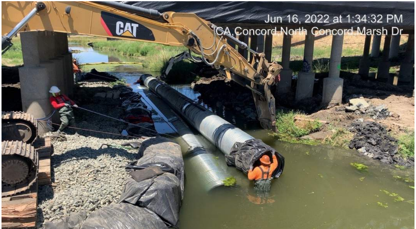
Figure 2 – Stage2 Creek Diversion