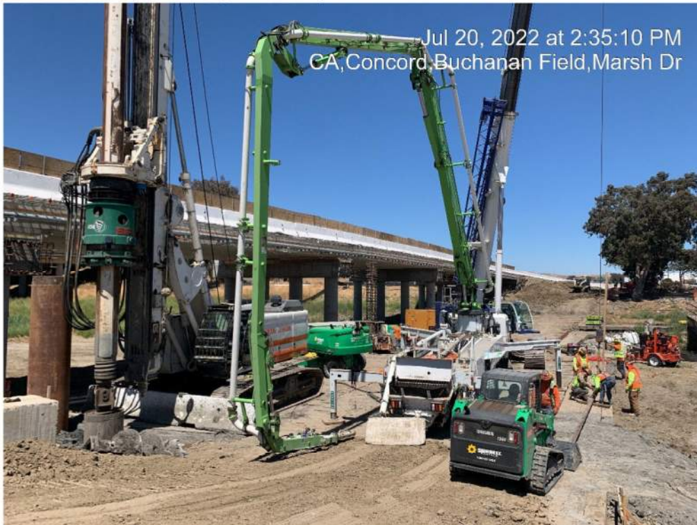
Figure 3 – CIDH Pile Construction