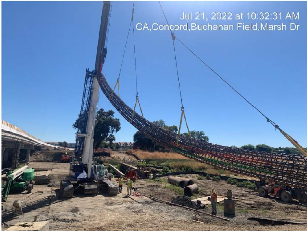
Figure 5 – CIDH Pile Cage Pick