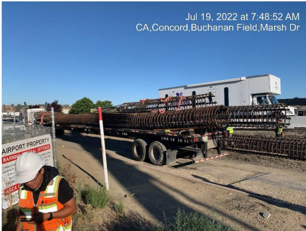
Figure 2 – Pile Cage Delivery