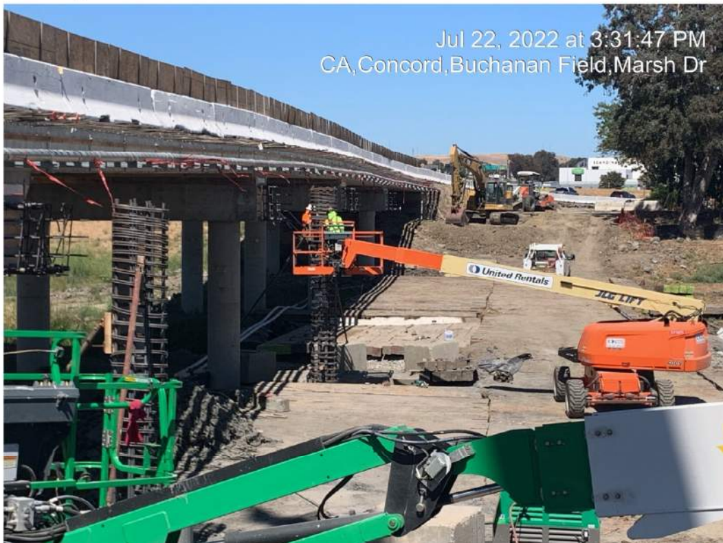
Figure 6 – Pier 2E and 3E Columns