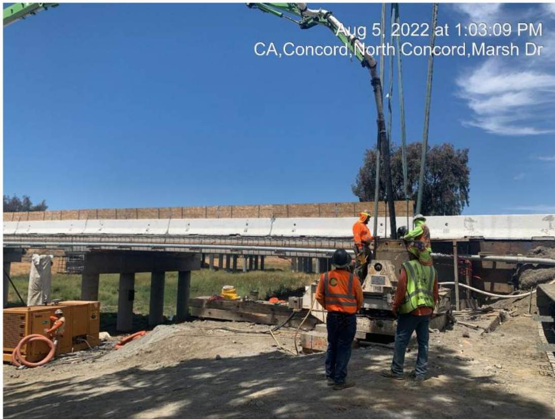
Figure 2 – Abutment 6 Pile 6F