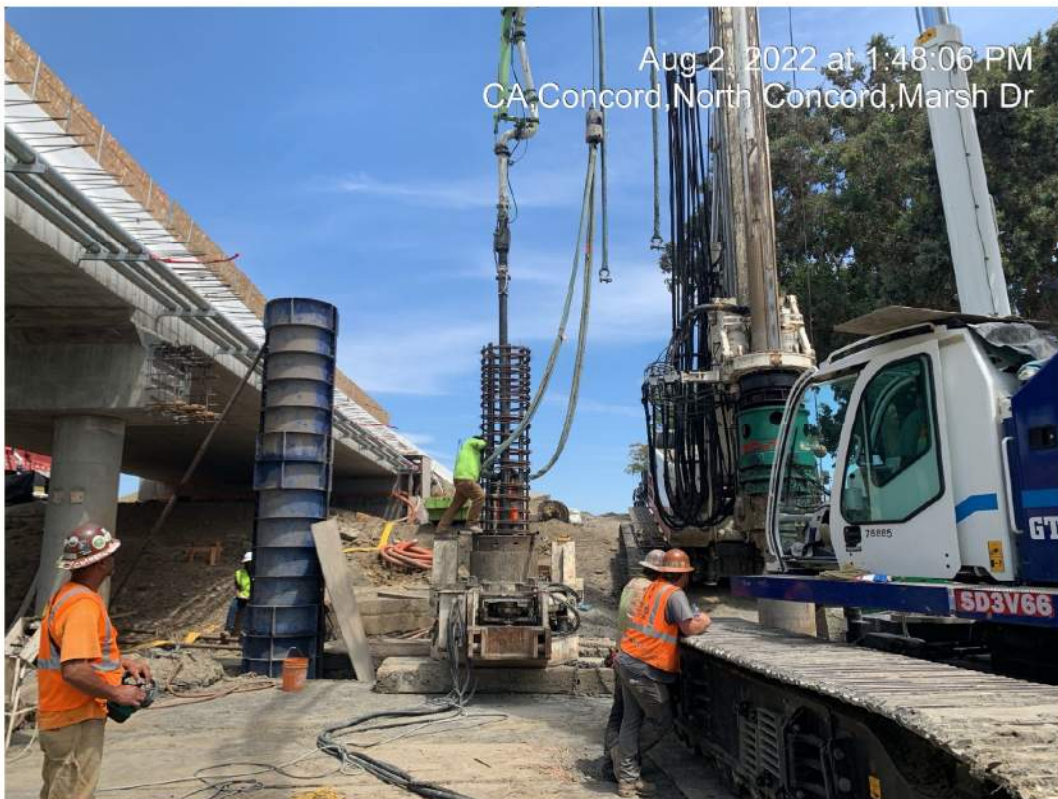
Figure 4 – Pier 2 Cap Falsework and Pier 5 Column and Pile 5F