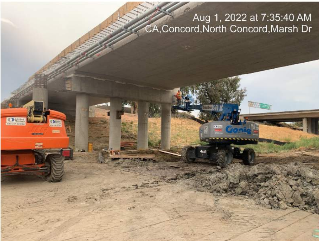
Figure 3 – Pier Cap Falsework and Stage 1 Bridge Finishing