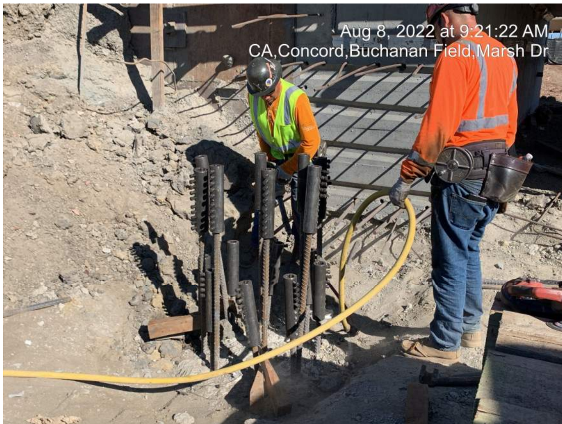
Figure 4 – Abutment 1 Pile Cage Extension