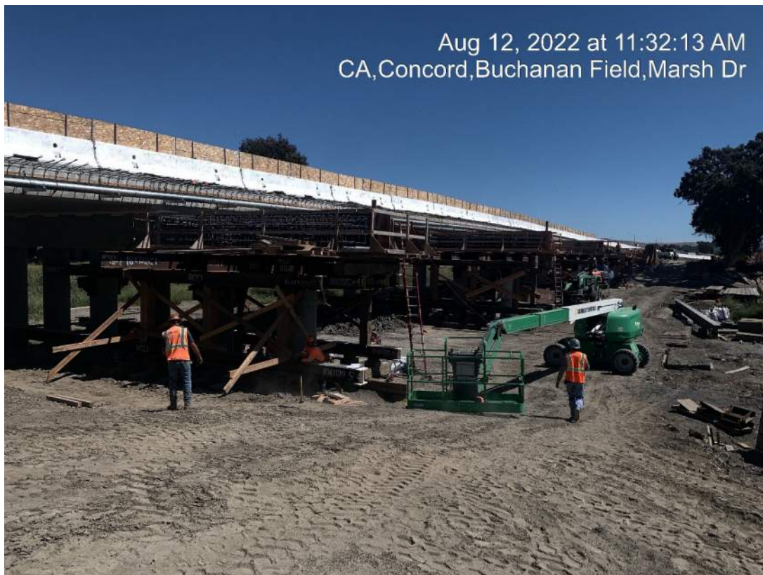
Figure 2 – Pier Caps