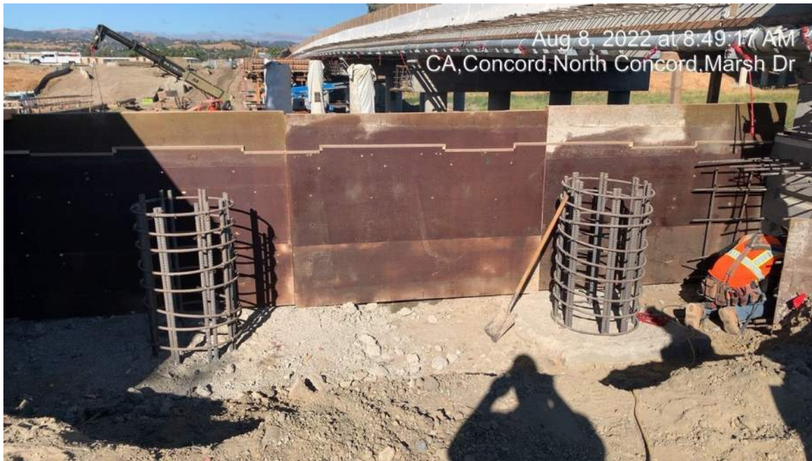
Figure 3 – Abutment 6 Forming