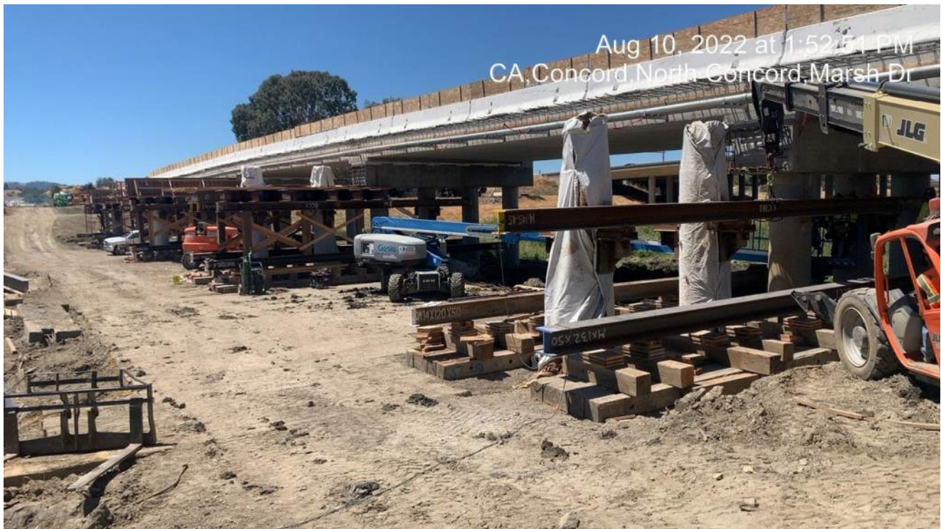
Figure 5 – Pier Cap Falsework