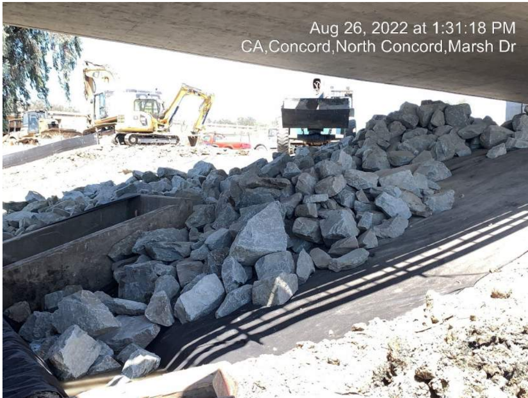
Figure 6 – Roadwork – Stage 1 – Rock Slope Protection