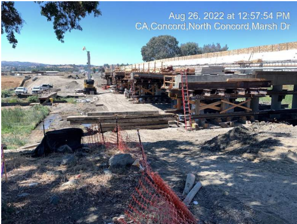
Figure 5 – Bridgework – Falsework and EOD Forming