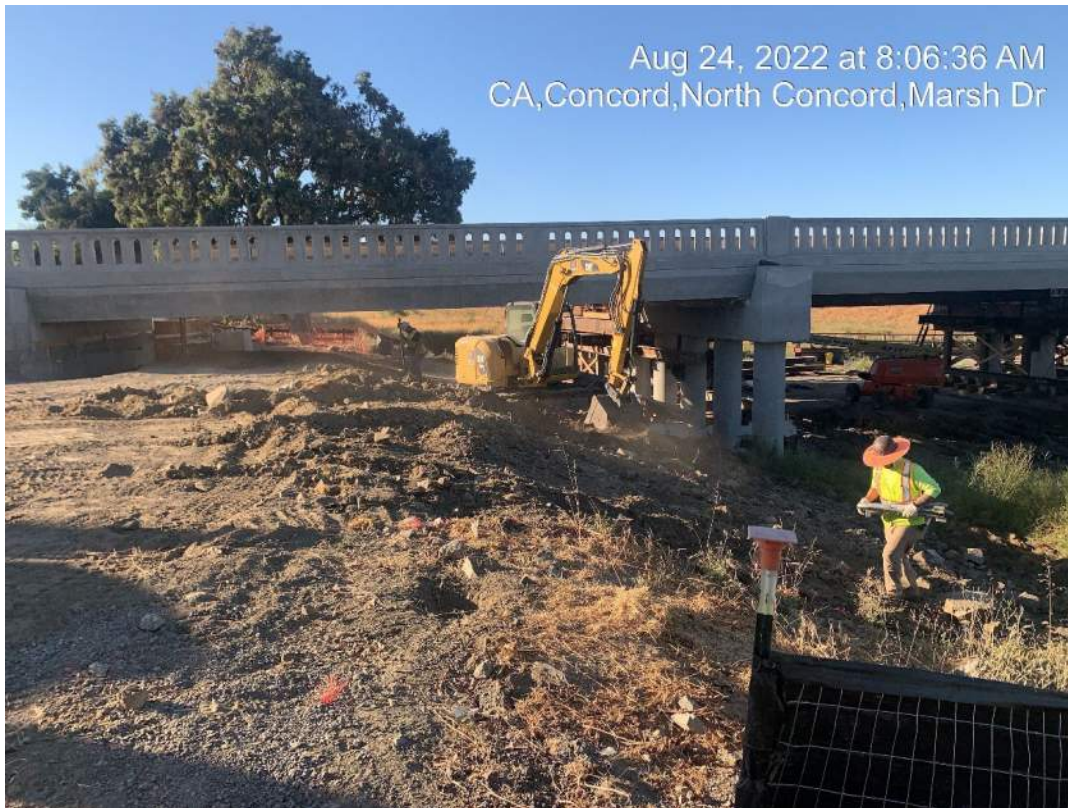
Figure 2 – Stage 1 – Installing Rock Slope Protection