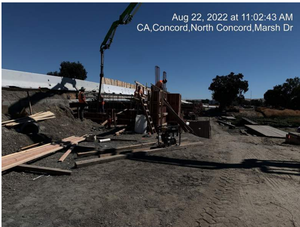
Figure 3 – Abutment 1 & 6 Concrete Pour