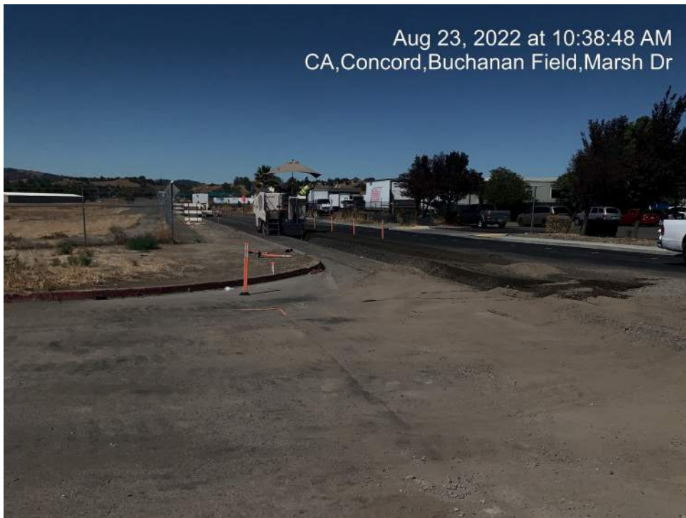
Figure 4 – Stage 2 - Roadwork