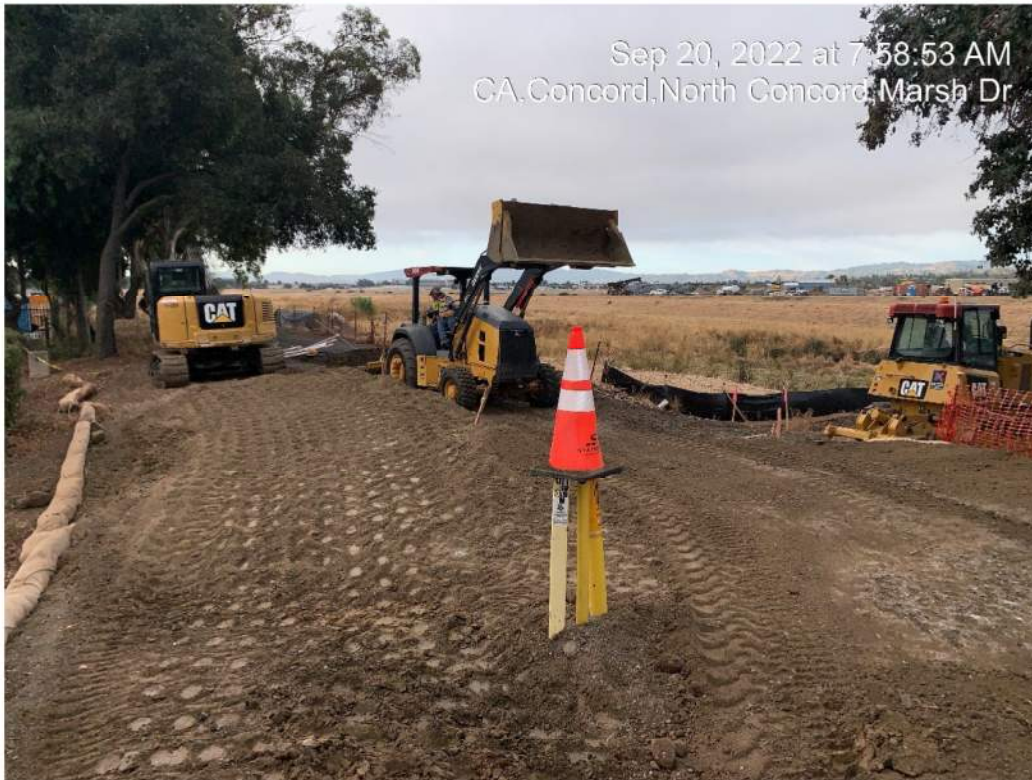
Figure 5 – Stage 2 Roadwork – Iron Horse Trail