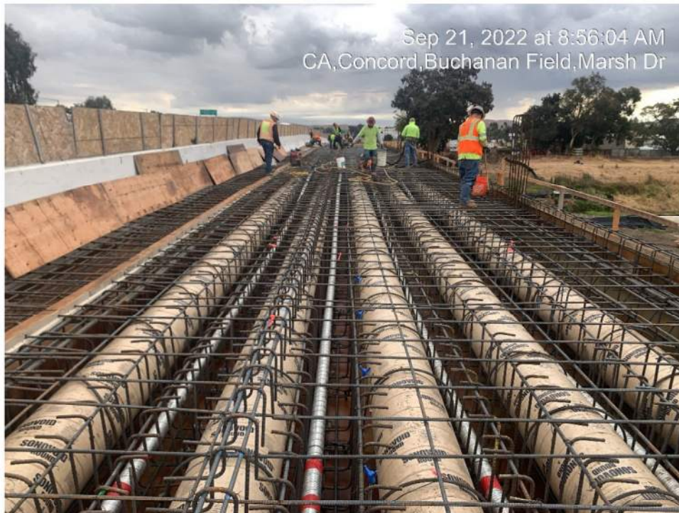
Figure 4 – Install Bridge Deck Rebar and Sono-Voids