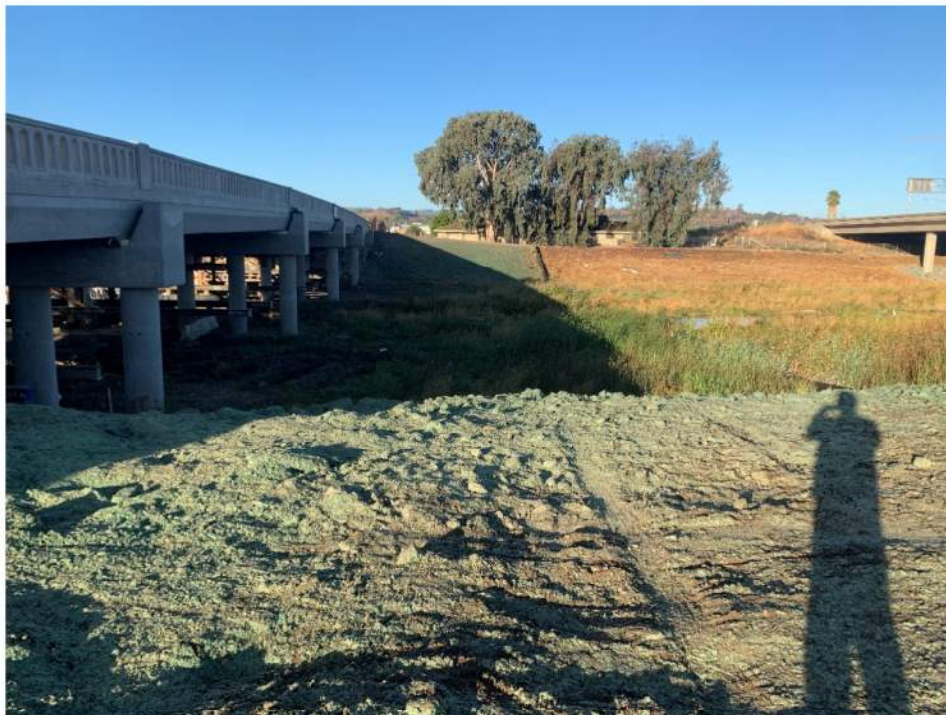
Figure 2 – Ready Site for Storm Event