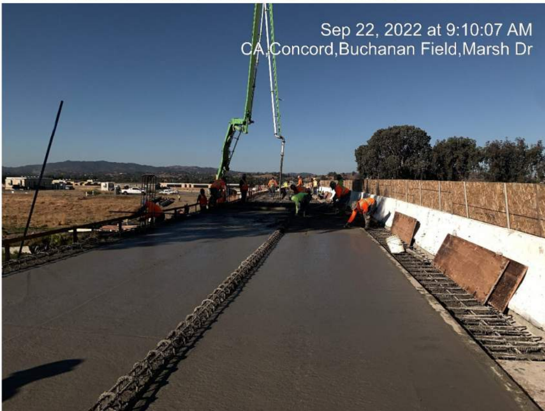
Figure 3 – Pour Bridge Deck