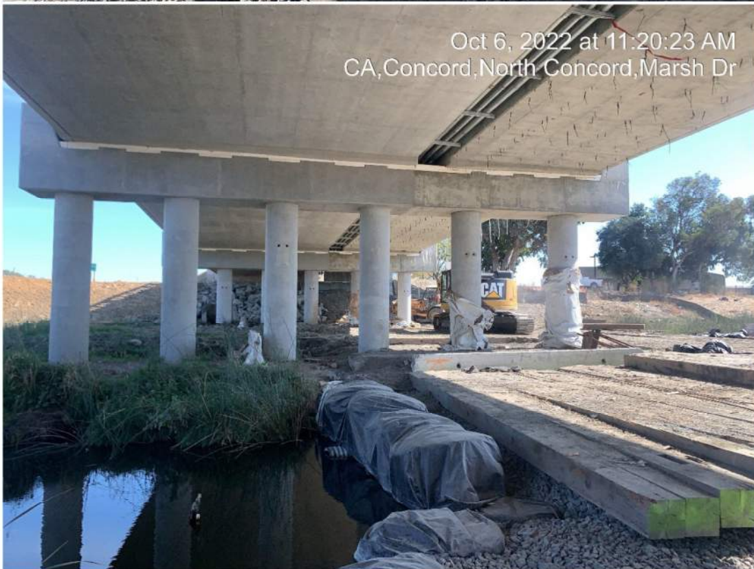
Figure 5 – Clean up