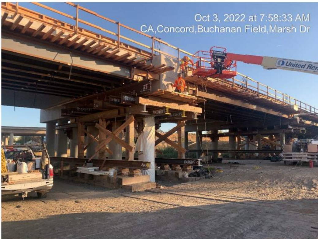
Figure 3 – PT Grouting and Dry Finishing