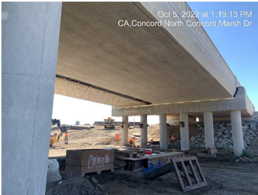
Figure 4 – Bridge Work - Cleanup