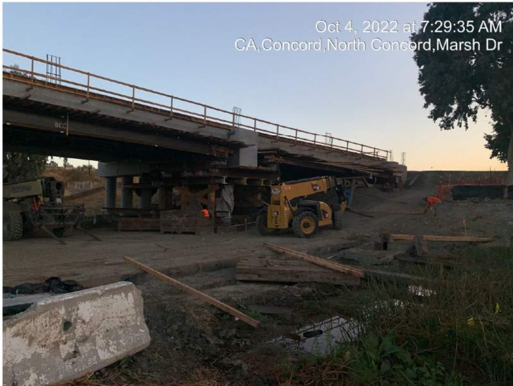
Figure 2 – Falsework Removal