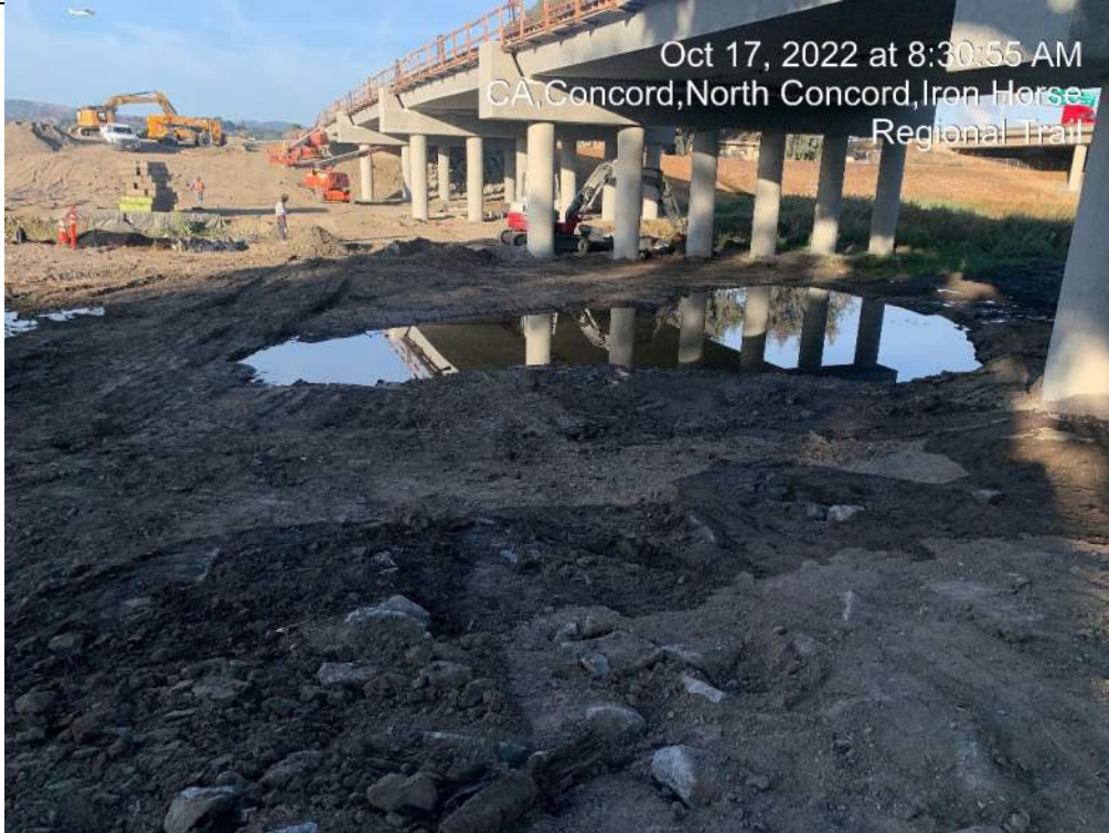
Figure 3 – Flood Plain Cleanup