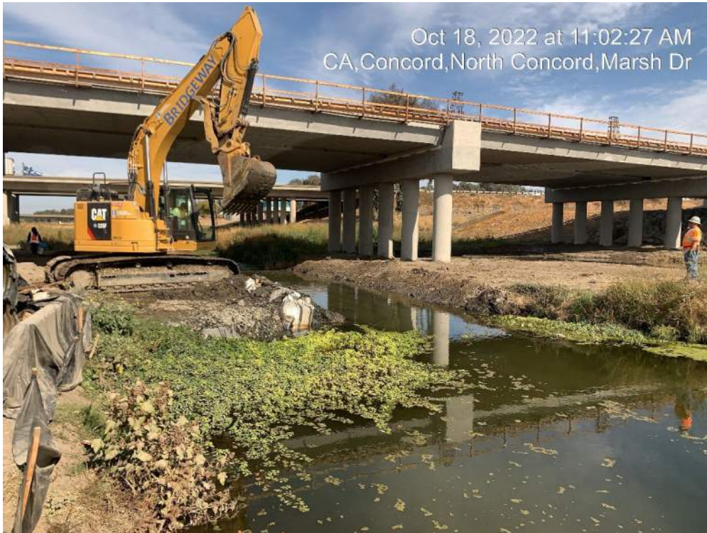
Figure 6 – Creek Restoration