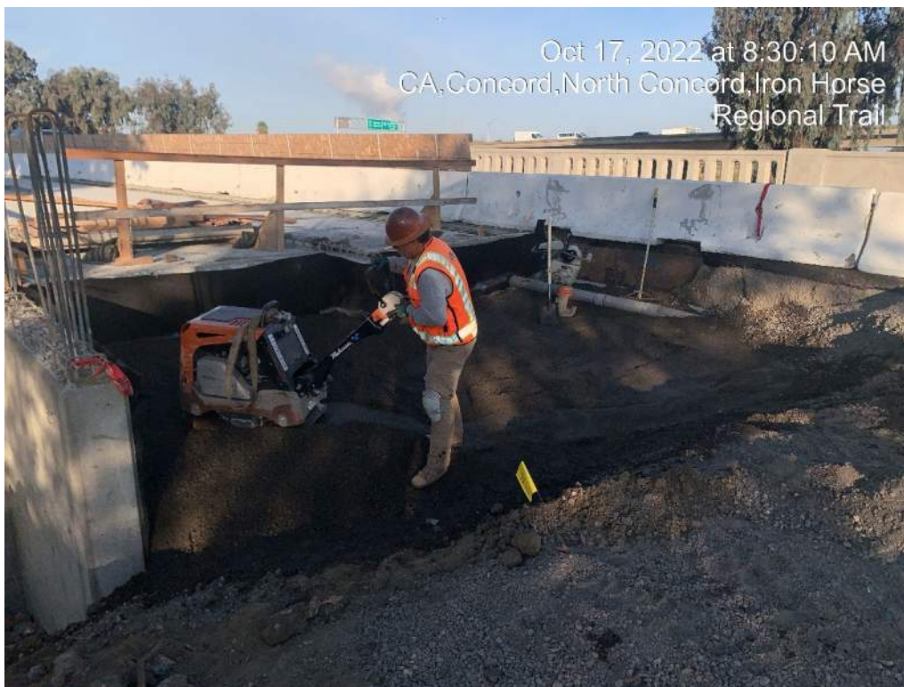
Figure 2 – Abutment Structure Backfill