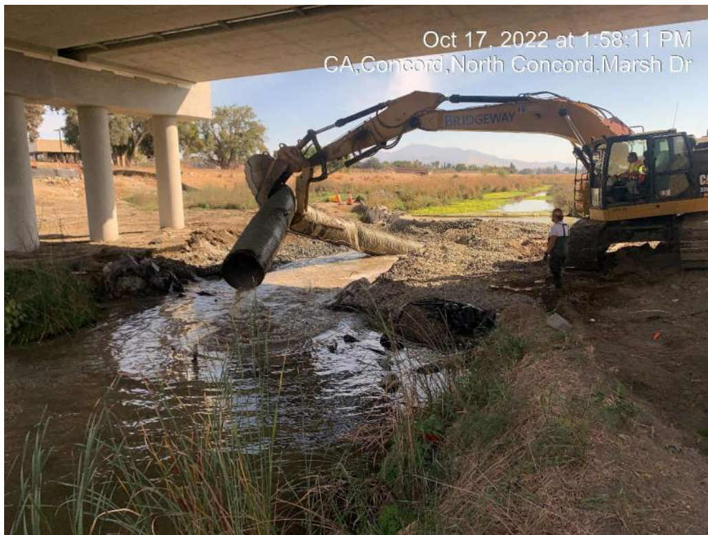
Figure 5 – Creek Diversion Removals