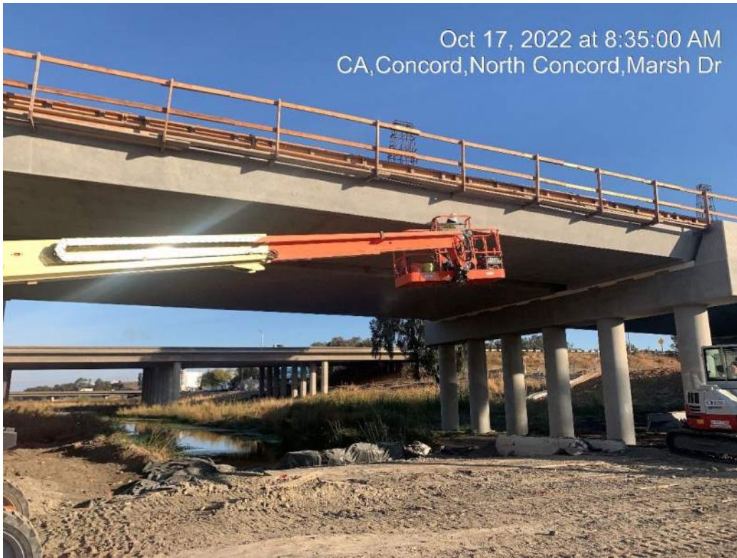
Figure 4 – Bridge Concrete Dry Finishing