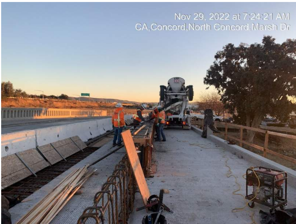
Figure 3 – TxDOT Barrier Rail