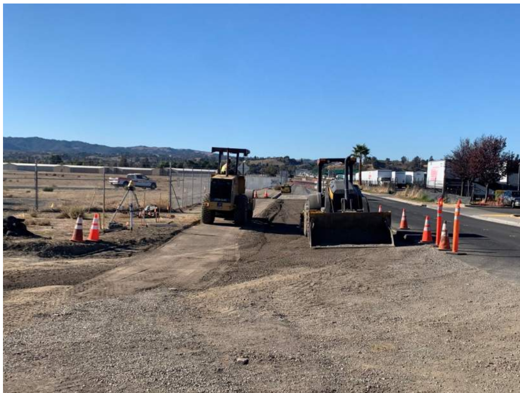
Figure 2 – Grading and Base Rock at Airport Driveway