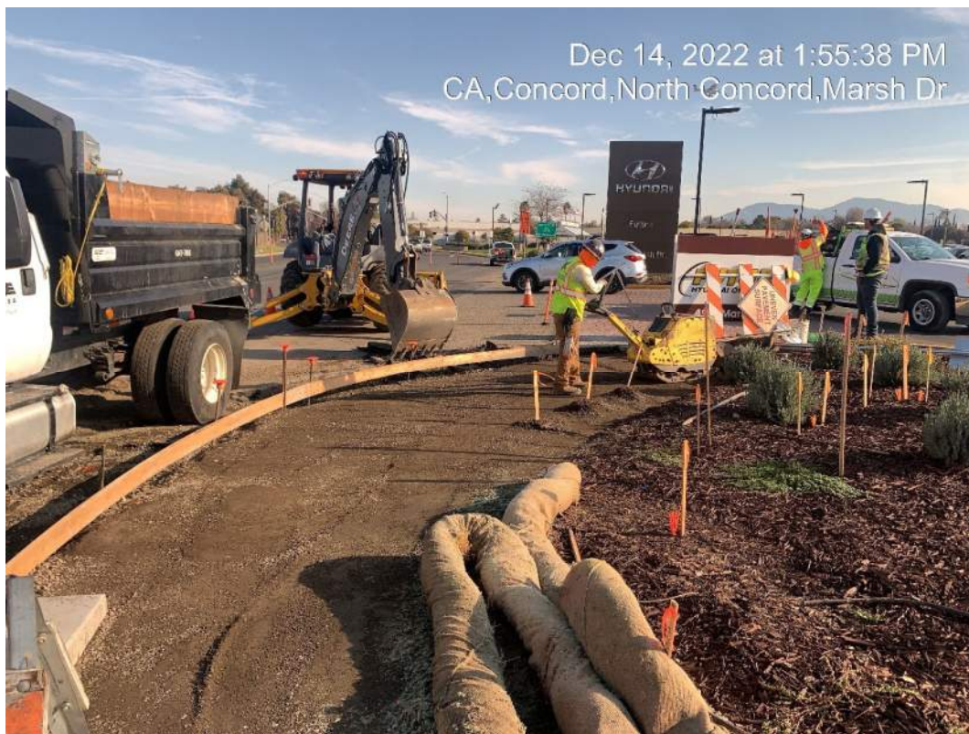
Figure 3 – Curb Ramp at Dealership