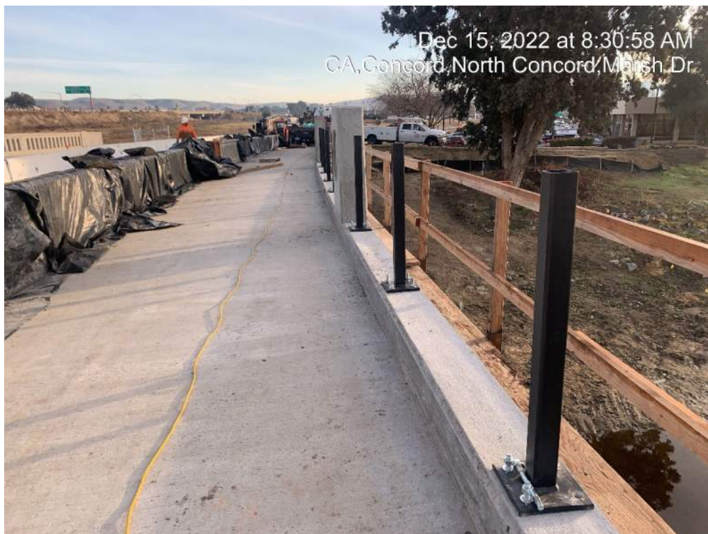
Figure 5 – Bridge Ped Rail Post Install