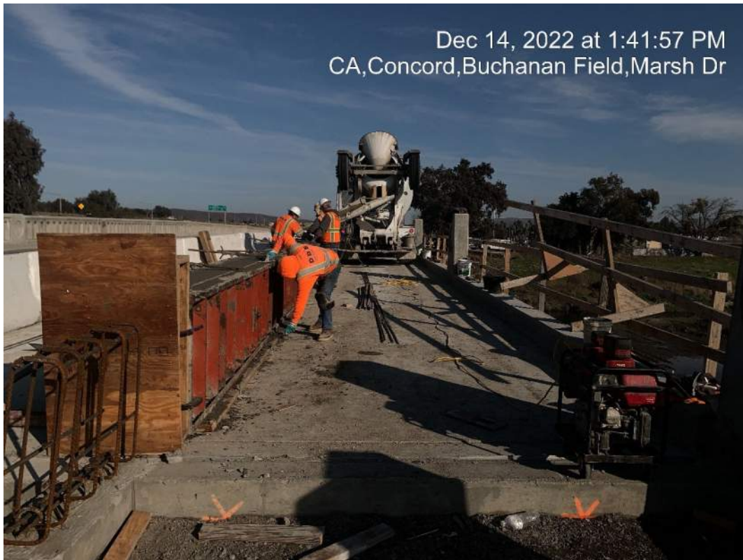
Figure 2 – Bridge Barrier Rail – Form and Pour