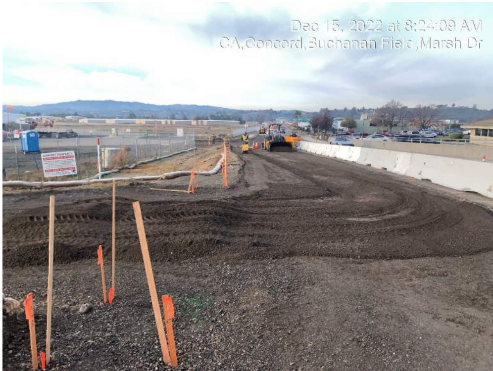
Figure 4 – Bridge Deck Closure Pour