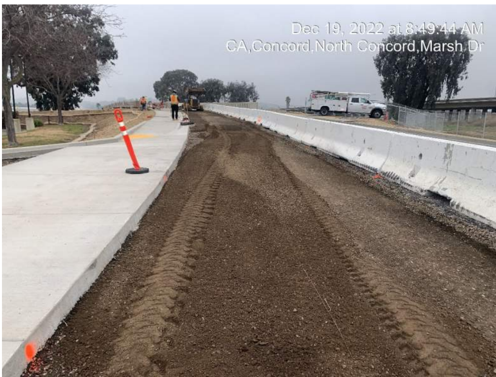
Figure 3 – Driveway 4 and 5 - Curb Ramp at Dealership