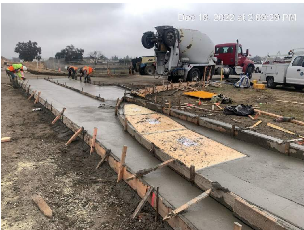
Figure 4 – Airport Driveway – Curb Apron