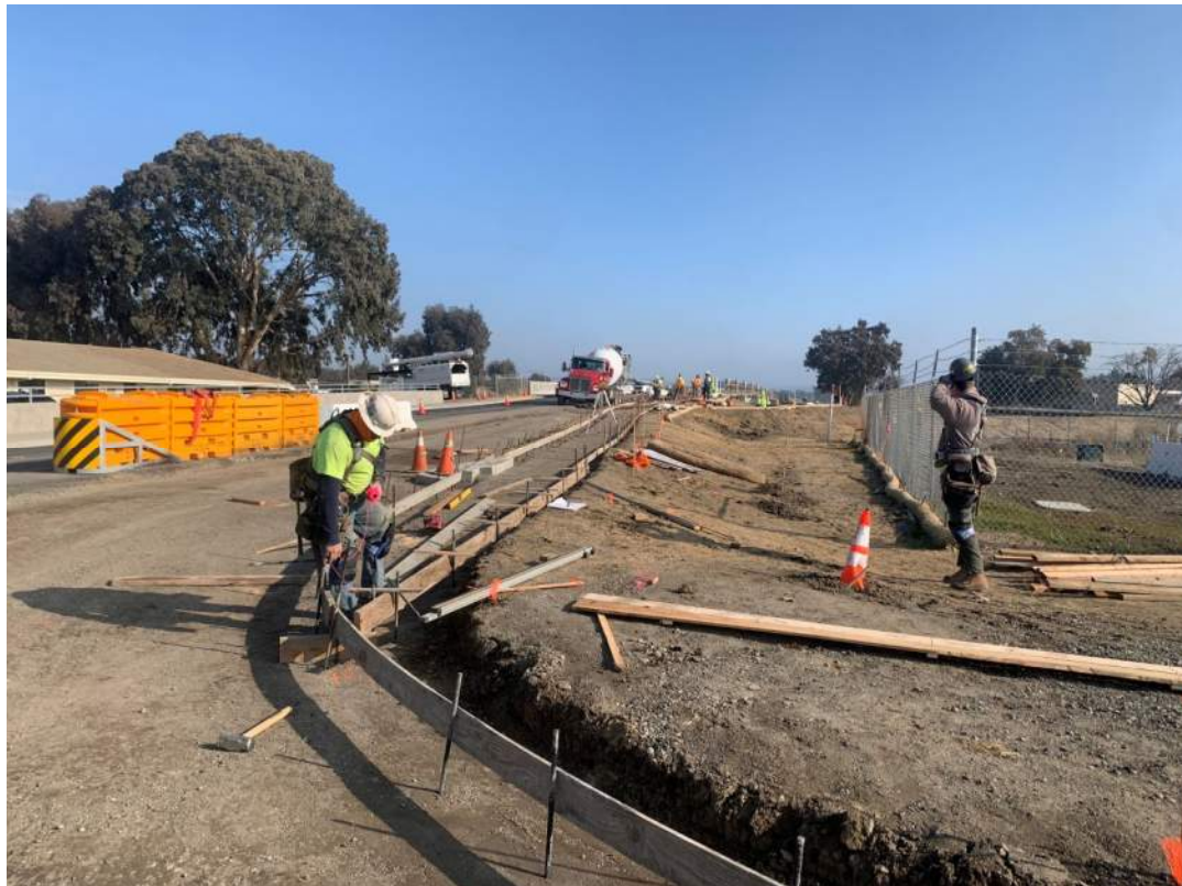
Figure 2 – West Side Concrete Flatwork – Curb / Gutter and Sidewalk