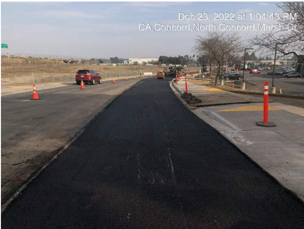
Figure 4 – Stage 2 – HMA Paving