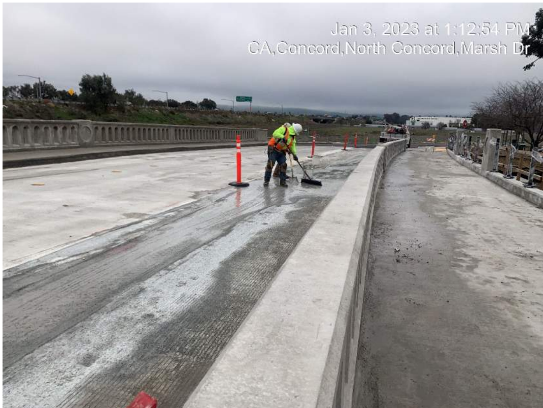
Figure 3 – Bridge Deck Profile Grinding