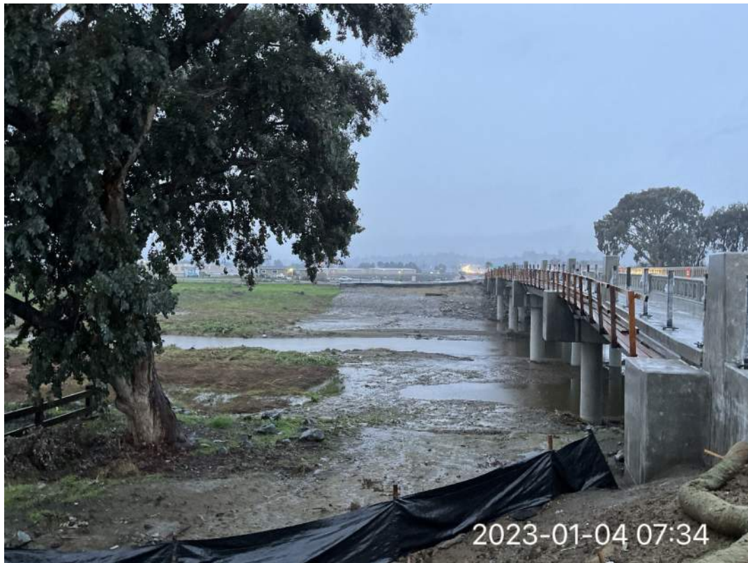
Figure 2 – Heavy Rains this Week