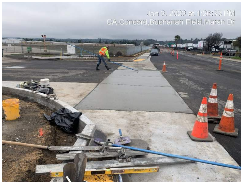
Figure 4 – Airport Driveway Apron