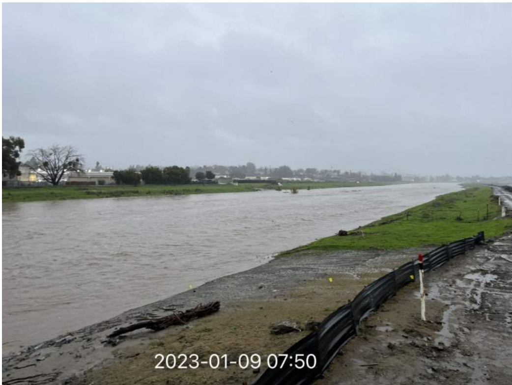
Figure 3 – Heavy Rains this Week