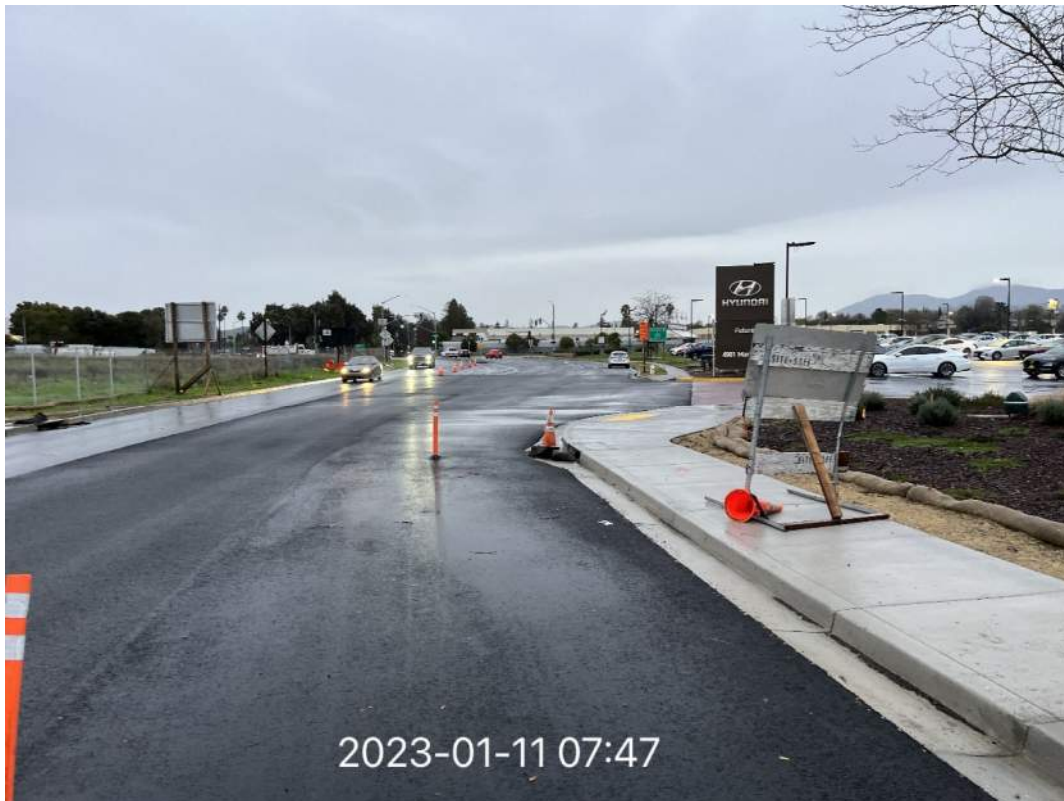
Figure 2 – Heavy Rains this Week