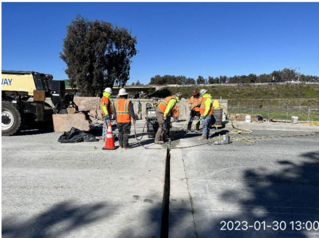
Figure 3 – Crew Installing Joint Seal