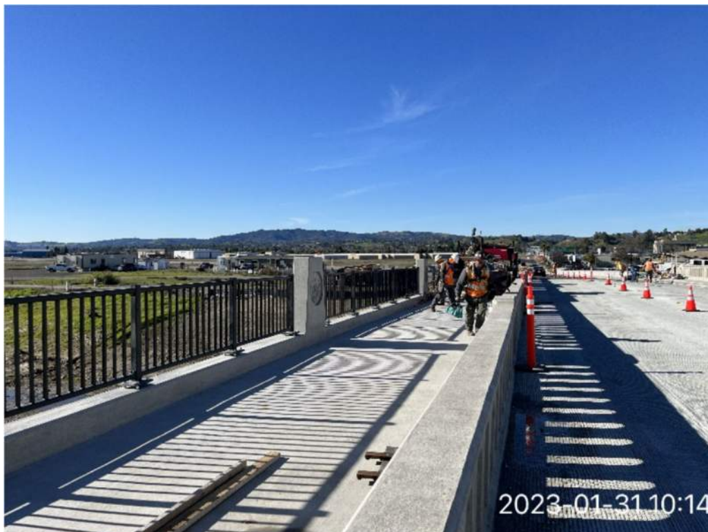
Figure 2 – Pedestrian Rail Post Installation