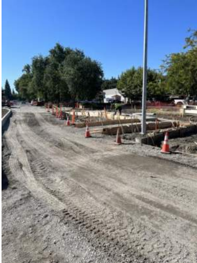
Figure 1. - Curb Formwork