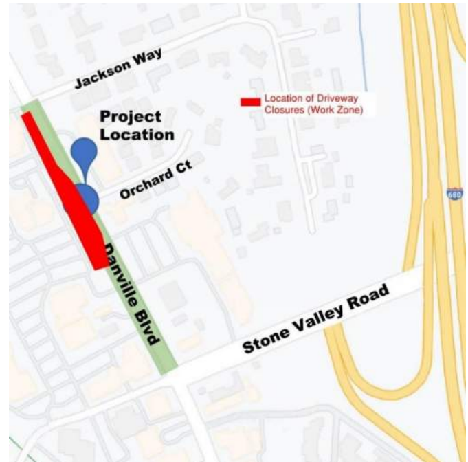
Figure 3. - Location of driveway closures and current work zone.

CONTACT: For more information, please visit the project website page at : www.contracosta.ca.gov/alamoroundabout . If you have questions or comments about the project, please call the Project Information Line at 800-406-4260 and leave your name, phone number, and the best time to reach you, along with your comments or questions, and a member of the project team will respond within 24 hours.