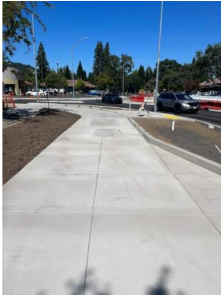
Figure 1. - Roundabout Paving